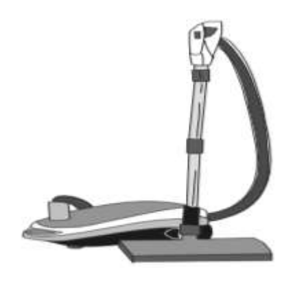
Figure 1.4. A vacuum cleaner

Vacuum cleaner- it works on electricity and has a fan. This sucks in the dirt and dust from the surfaces and stores it in a disposable bag inside. This bag should be emptied regularly.